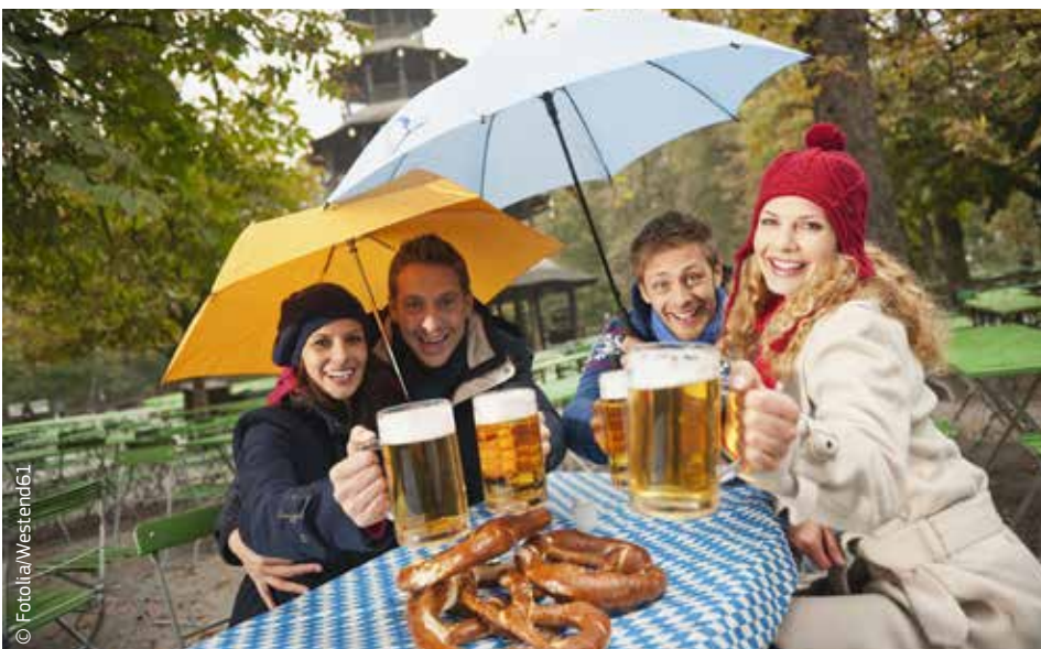
What you see: four friends having a good time in a beer garden in Munich. What you don't see: the EU fosters fair trade by harmonising excise duties on beer.

Legislation in the direct tax area is limited to bringing the different laws in each EU country more in line with each other (approximation of laws). This can only be done to the extent necessary to improve the functioning of the European Union's internal market and address common cross-border challenges such as tax evasion.